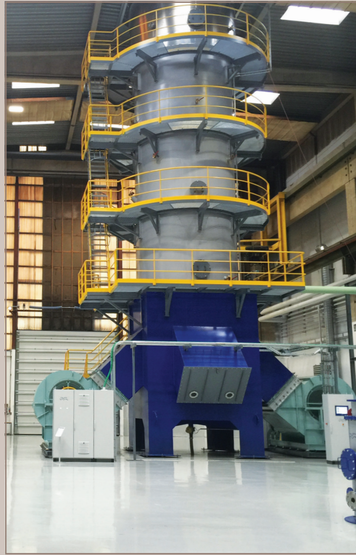
Alfa Laval Test & Training Centre

For more information, please visit www.alfalaval.com/marine